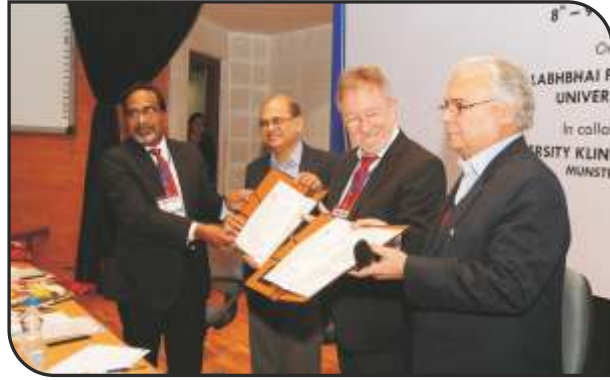
Signing of MoU b/w V.P Chest Institute, University of Delhi, India & University of Klinikum Munster, Munster University, Germany